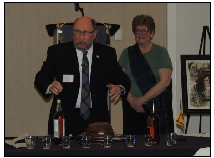
"O what a glorious sight, Warm-reekin, rich!"