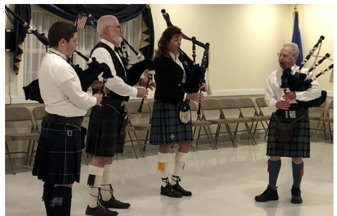
It just wouldn't be right without some pipe music!