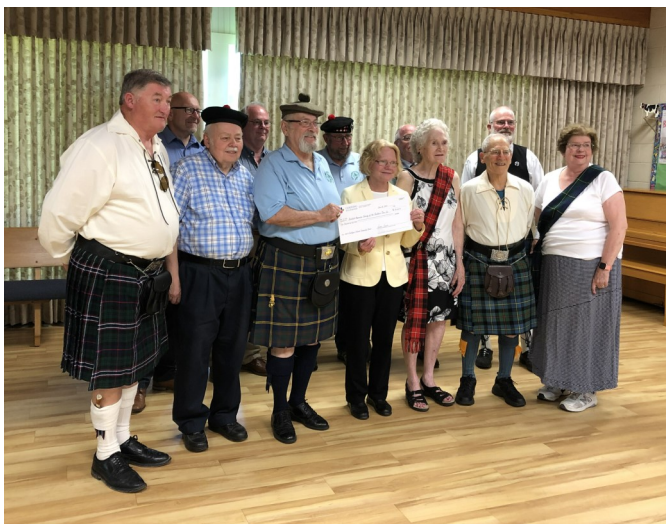
The Board accepts the Corning Foundation check!

Border Reivers did not wear kilts. Kilts were a highland tradition.