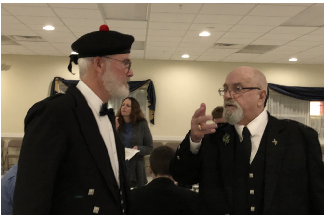
Incoming and outgoing comparing notes